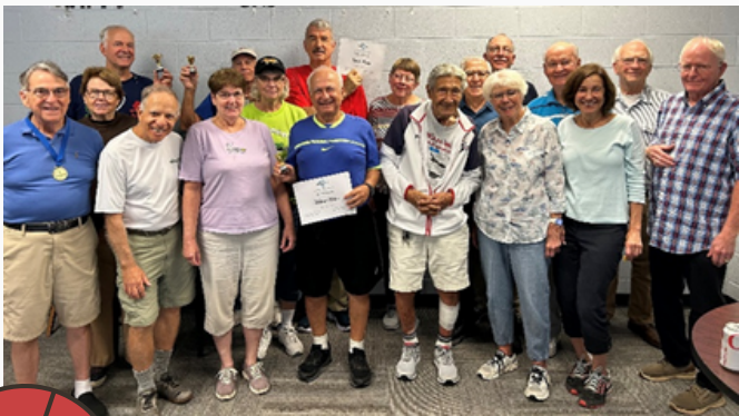
The 2024 bocce winners!

The bocce season came to a close at the end of September on Thursday, September 26th at 11:00 a.m. with a pizza party and awards ceremony. Congratulations to all of our winners!